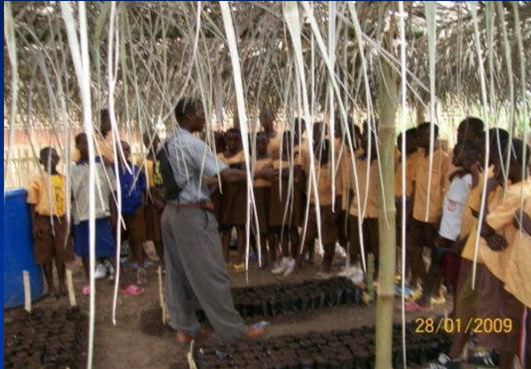
Krayawkrom, learning to position the cocoa seeds in nursery bags